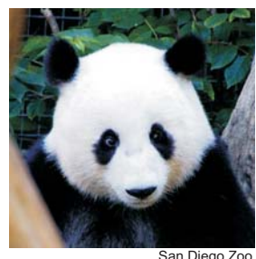
San Diego Zoo